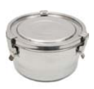
A-SSFC-AR12 ROUND AIRTIGHT FOOD CONTAINER 7.5cm X 12cm dia. Weight: 0.23kg Volume: 710 ml