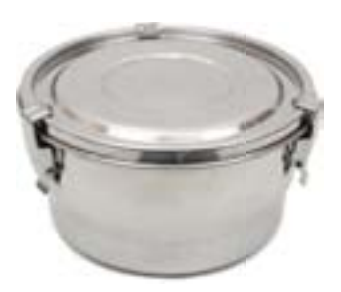
A-SSFC-AR14 ROUND AIRTIGHT FOOD CONTAINER 8.5cm X 14cm dia. Weight: 0.29kg Volume: 1125 ml