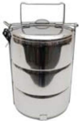
A-TIF3-14-CQ6 3-TIER TIFFIN 10 in. X 6 in. dia. Weight: 32 oz.