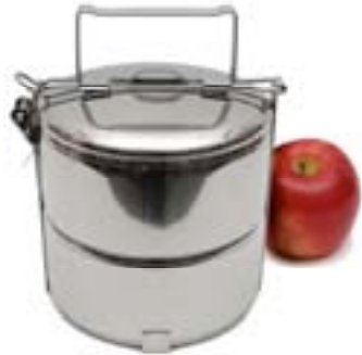
A-TIF2-14-CQ6 2-TIER TIFFIN 7 1/2 in. X 6 in. dia. Weight: 24.7 oz