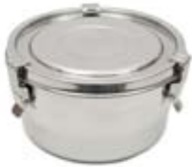
A-SSFC-AR12S-CQ16 ROUND AIRTIGHT FOOD CONTAINER 3 in. X 4 3/4 in. dia. Weight: 8.1.5 oz. Volume: 24 fl. oz.