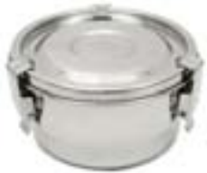
A-SSFC-AR10S-CQ16 ROUND AIRTIGHT FOOD CONTAINER 2 5/8 in. X 4 in. dia. Weight: 6.4 oz. Volume: 14.5 fl.oz.