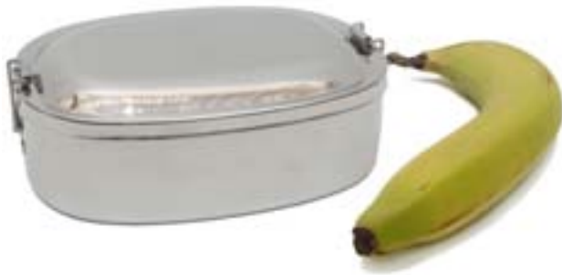
A-SSFC-O16-CQ12 16CM OVAL FOOD STORAGE CONTAINER 6 1/4 in. X 5 in. X 2 in. Weight: 11.3 oz.