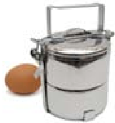
C-TIF2-10-CQ6 MINI TIFFIN 6 1/4 in. X 4 in. dia. Weight: 15 oz.