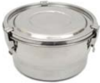
A-SSFC-AR14S-CQ16 ROUND AIRTIGHT FOOD CONTAINER 3 3/8 in. X 5 1/2 in. dia. Weight: 10.3 oz. Volume: 38 fl. oz.