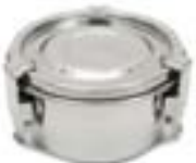
A-SSFC-AR8S-CQ16 ROUND AIRTIGHT FOOD CONTAINER 2 1/4 in. X 3 1/4 in. dia. Weight: 5 oz. Volume: 8 fl. oz.